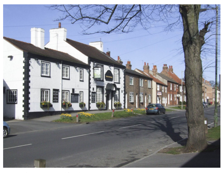
Main Street Fulford

This leaflet summarises the appraisal findings, which include proposals for boundary changes, and invites your comments