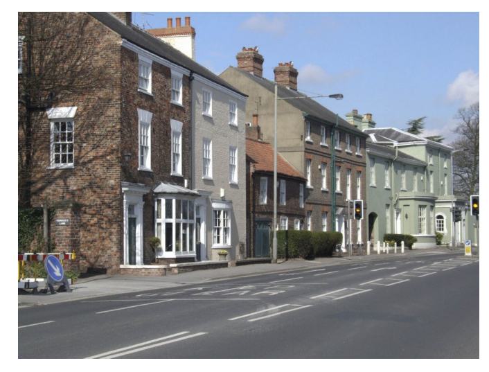
18<sup>th</sup> & 19<sup>th</sup> Century Buildings Main Street North